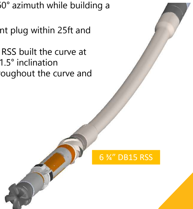
6 3/4" DB15 RSS